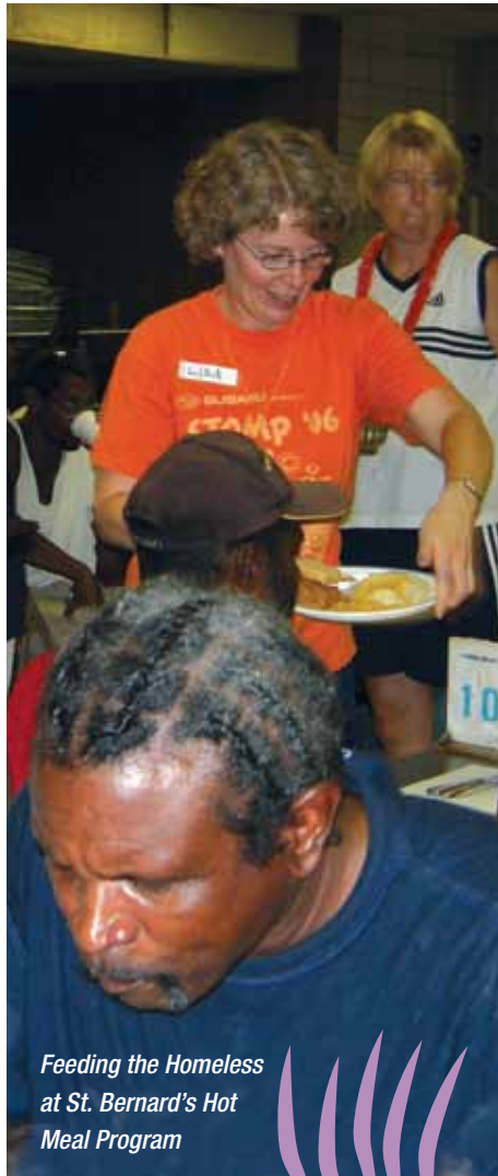
Feeding the Homeless at St. Bernard's Hot Meal Program