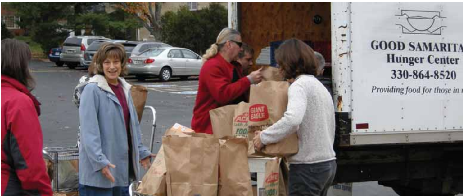
6 The Family Life program assists with the the Feed My People collection for the Good Samaritan Hunger Center, which also receives financial support from St. Hilary Parish.

The parish provides 3% of our offertory to community agencies and programs. For July 1, 2009- June 30, 2010, we unfortunately had to decrease the amount of outreach to 2% due to the deficit our offertory revenues encountered during that fiscal year. However, with the increase in our offertory, we have now returned to providing 3%. During this last fiscal year, we provided $35,000 in outreach to the following organizations: St. Bernard Hunger Program, Good Samaritan Hunger Center, OPEN-M, Pregnancy Care of Summit County, Catholic Social Services, Access, the International Institute of Akron, Catholic Worker, HM Life Opportunities and Cartie’s Kids. Also to Gennesaret, St. Hilary Youth Mission Trip and Springtime of Hope.