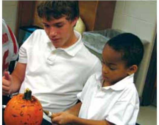
All classes are matched with “buddy” classes to share activities during the year.