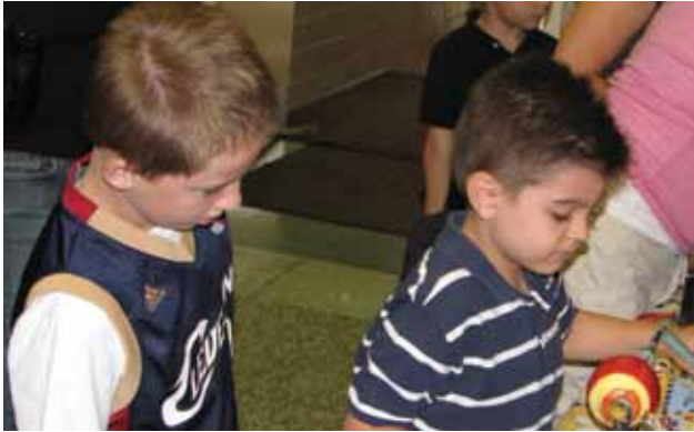
Kindergarten students learn about fractions of apples.