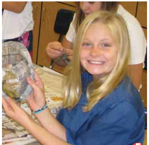
Grade 5 students made masks in art class.