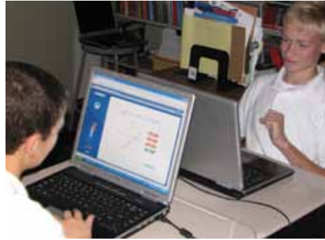
8th grade advanced math students compete in a national online math contest.