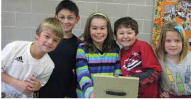
Grade 3 students conduct a bake sale to purchase items for needy children on the parish Giving Tree.