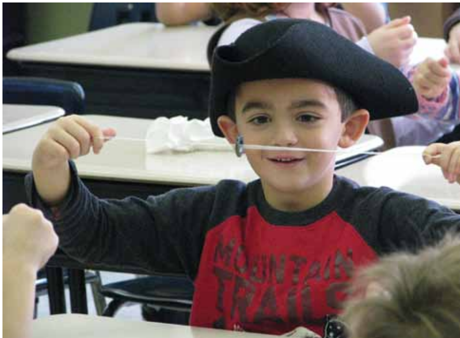
Second graders participated in Colonial Day, learning about colonial life.