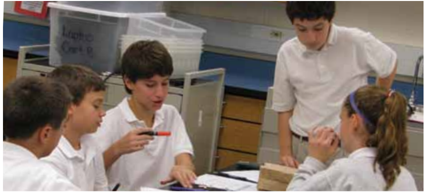
7th grade students discuss a lab experiment they conducted and prepare a lab report.