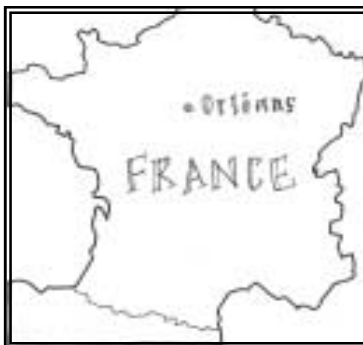
Francis is born in Orleans, France in 1607.

Learn about Powerful Priests Past & Present at Adventures in Faith, Sunday, Feb 21, 12:15. Registration forms available after Mass, in the parish office or at www.sthilarychurch.org .